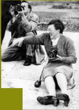
BCC 1950's Club Outing