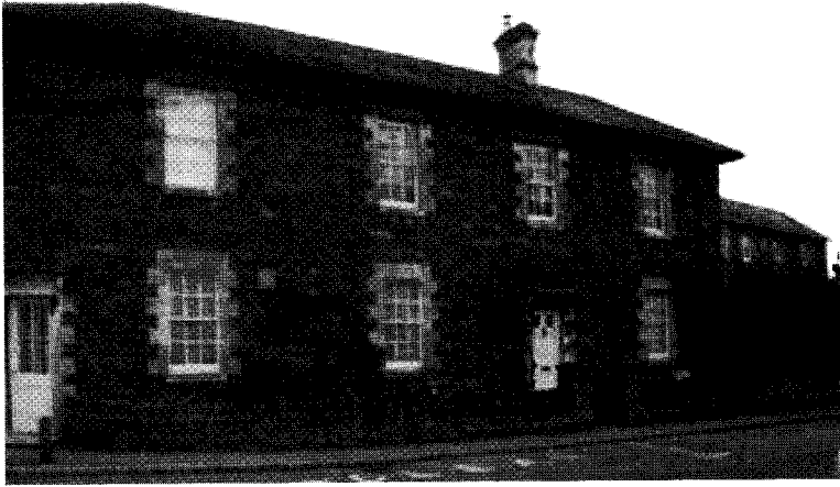
Fig 2: Former corner-shop and residential premises, now renamed The Old Manor House; the New Manor House, built by Charles Harris in 1836, is visible behind the hedge to the right.

The map shows, although not as clearly as one might wish, that by 1767 there was already the beginnings of a group of buildings spreading along Heyford Road from the Paines Hill corner towards The Dickredge (Fig 3).