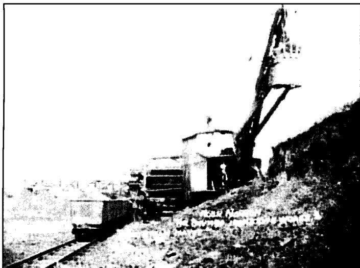
Photo 5 above. The working faces of the quarry were gradually extended northwards and west under the Adderbury-Aynho road to Navy Pit Ground; there the formation of step faulting was encountered. Step faulting is where the layers of stone are at an angle. See Photo 6 below.