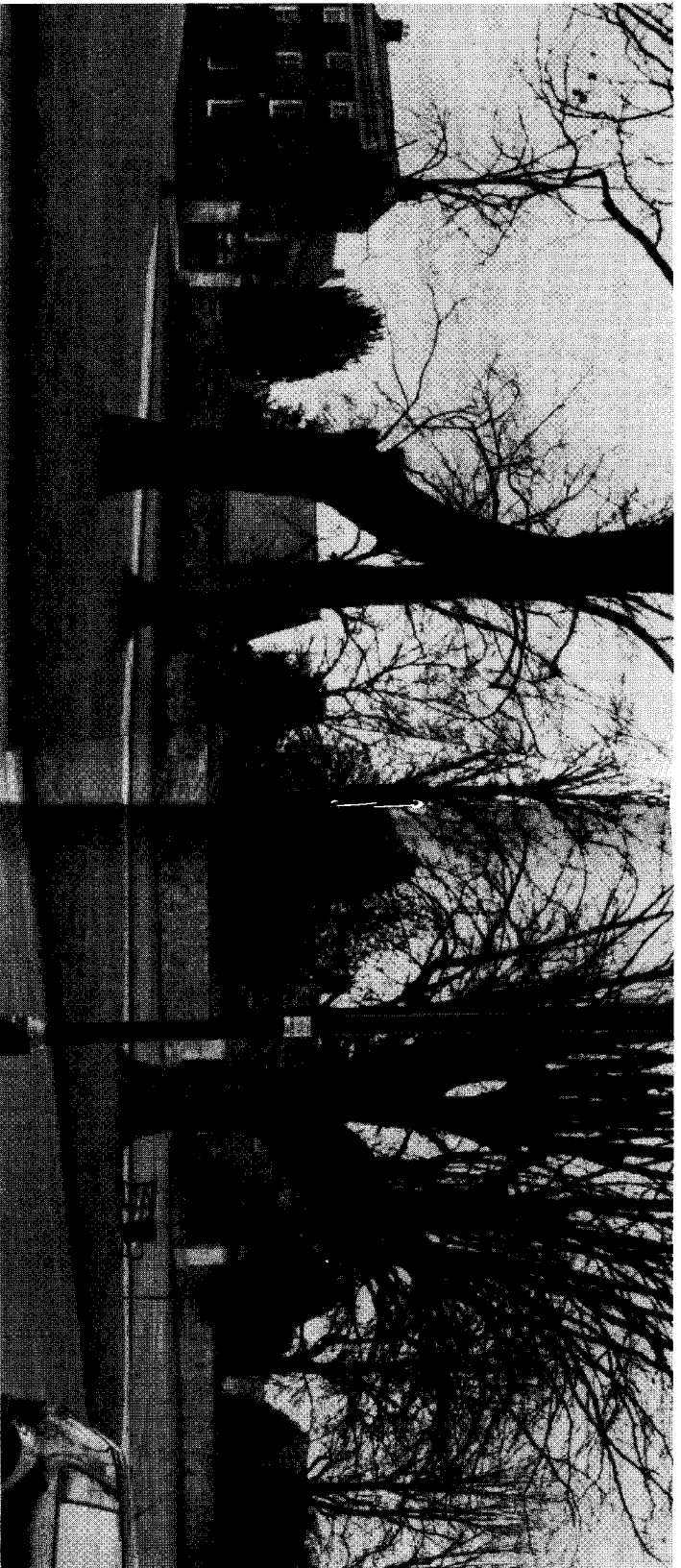
The Green, Adderbury, looking south to the site of the Cobb Mansion. The right-hand gate pillars are probably original but may have been repositioned. The house to the left is the original Summer House, the gate posts to its right are original with the date 1582 carved into them.