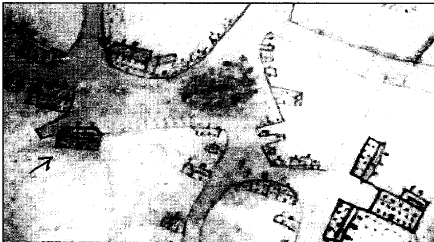
The 1735 map [ORO SL/30/3/M/I 1735]