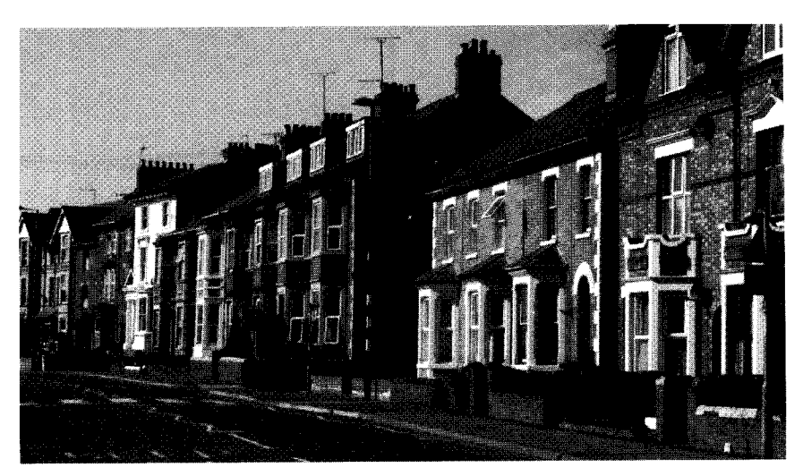
The intended villa 'gateway' to Banbury, the north side of Middleton Road; East Street entrance to the right.