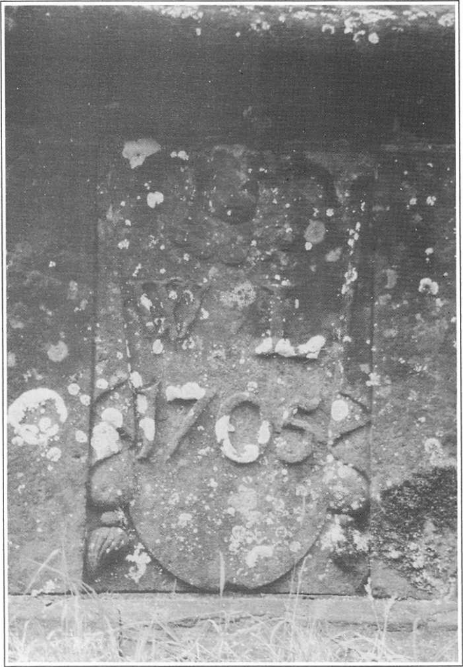
'W.L. - 1705'