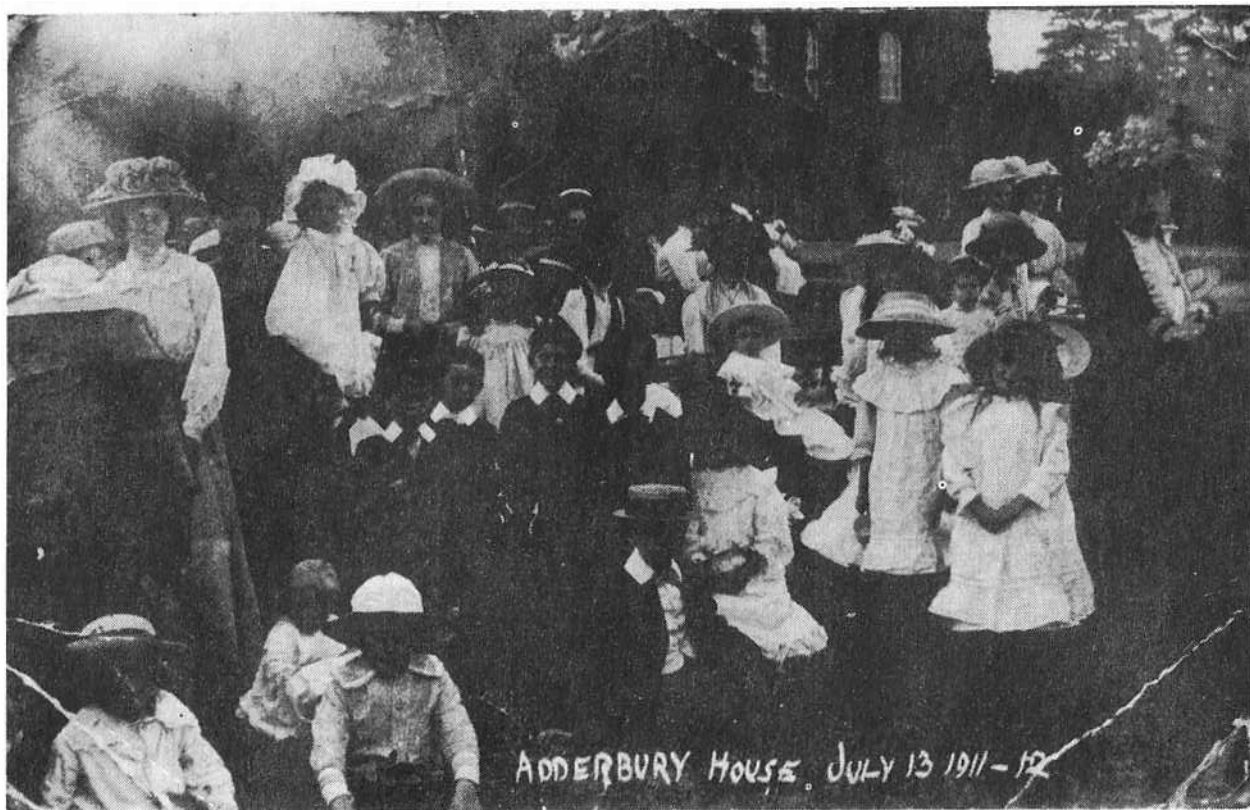
Adderbury House, July 13, 1911-12