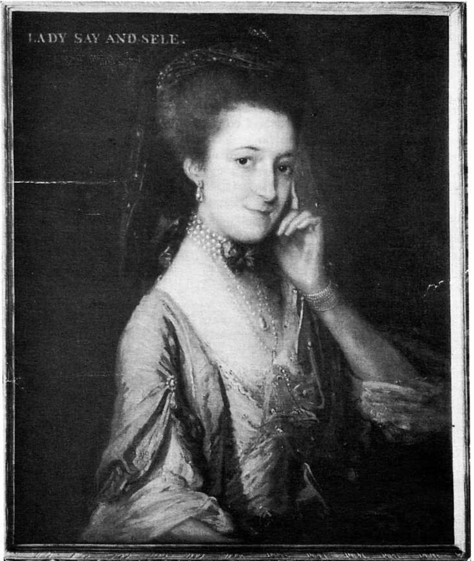
"His romantic wife"