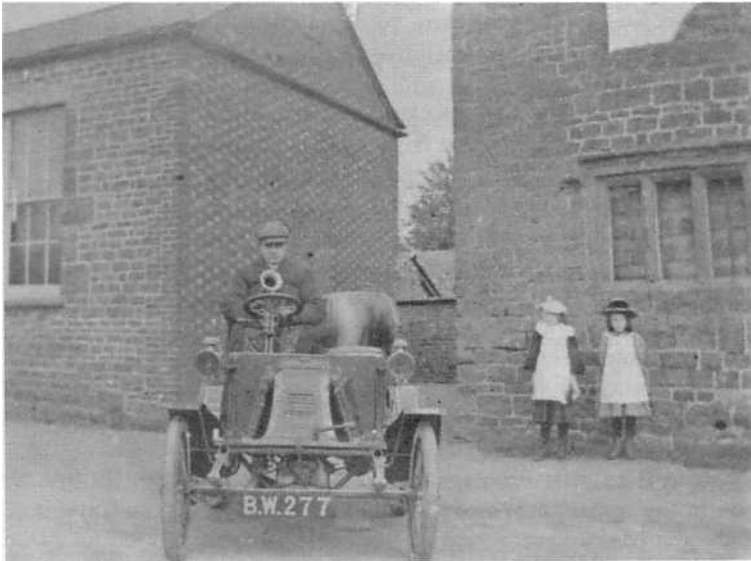
Stanley Wrench in an early car.