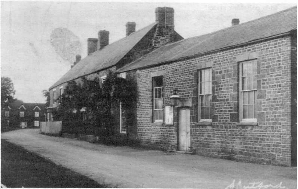
Premises of W. Wrench and Co in West Street before the fire. The Wesleyan Chapel and the Old Manor House at the end of West Street are still standing. The top of the factory chimney can be seen behind the Chapel.