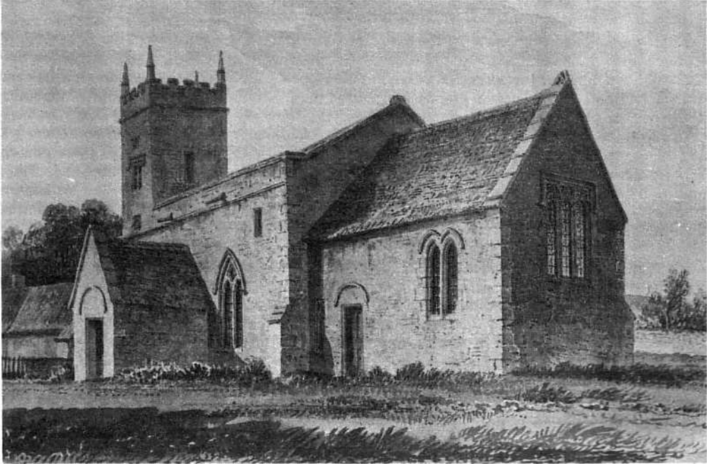
Fig. 1. South-east view of Barford St. John Church, Oxon., 1823, by J. C. Buckler. (MS Top. Oxon. a. 65, 71, Bodleian Library)