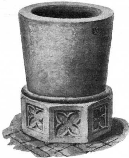
Fig. 2. Font in Barford St. John Church, 1823, by J. C. Buckler (MS Top. Oxon. a. 65, 73)