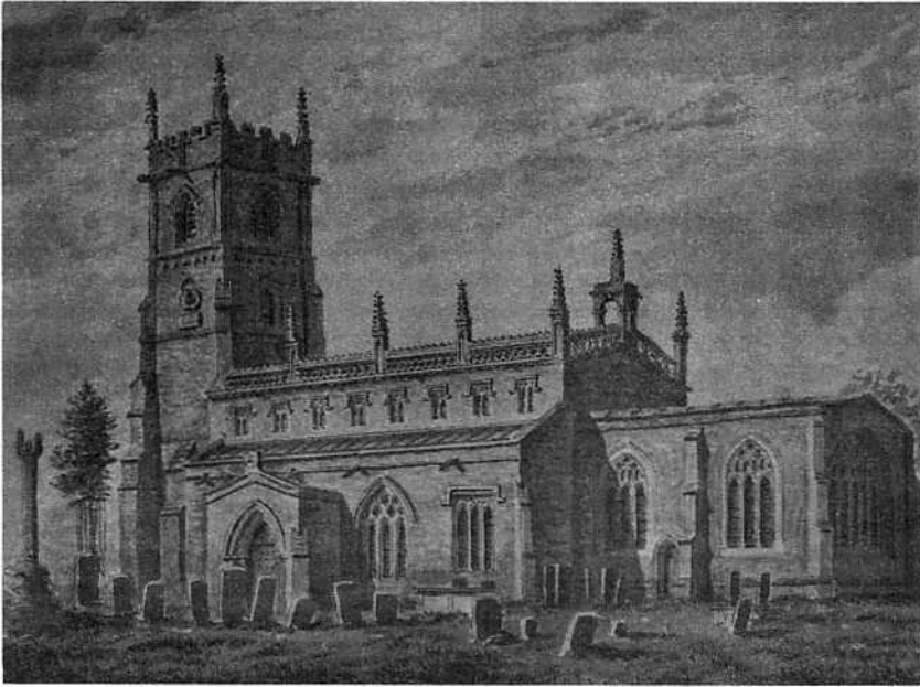
Fig. 4. Tysoe Church, Warw., early 19th century. (MS Beesley's History of Banbury, Vol. VI, p. 139.)