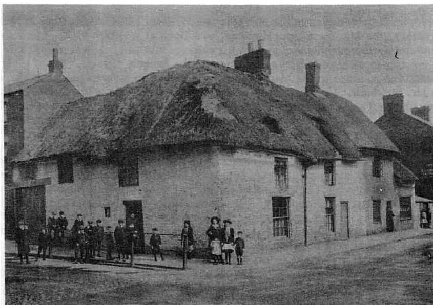
The corner of Broad Street and George Street showing the entrance to Church Court