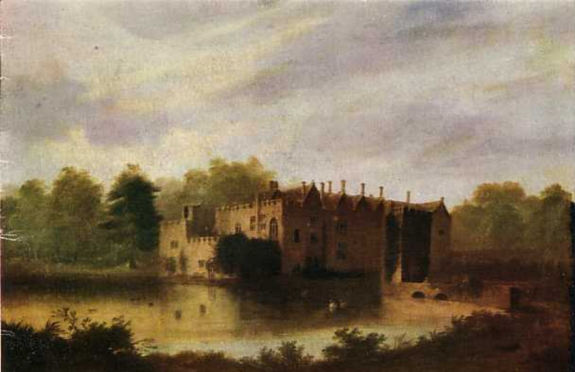
BROUGHTON CASTLE. LAMBERT. PINX t .